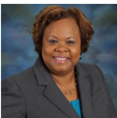
Chief Diversity Officer

Hillsborough County Public Schools is proud to announce the district's graduation rate has jumped to 82.9%, an all-time record for the district and higher than state graduation rate.